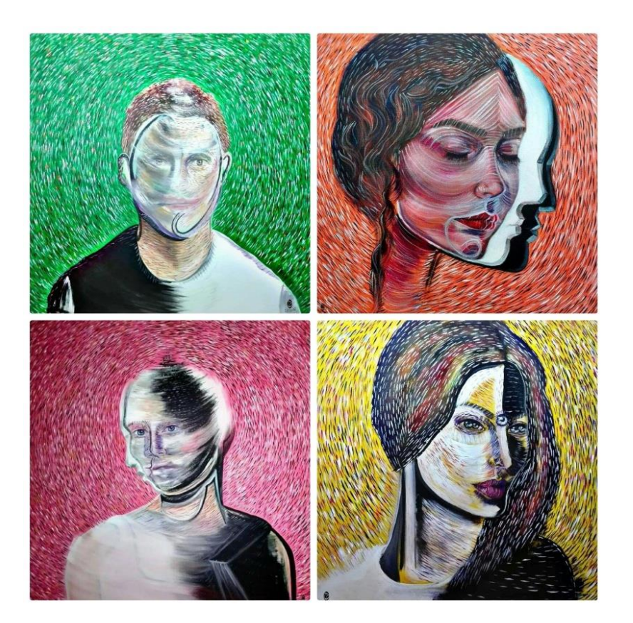
The meaning of Blue color in psychology,

Firstly blue is primary color, cool color or cold color and this spiritual color is also the color of the sky and sea.