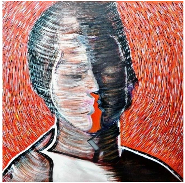
The meaning of Pink color in psychology,

Firstly Pink or magenta is a secondary color, a warm color.